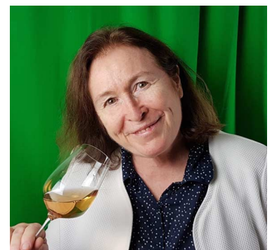
Rosé for Summertime, Rosé Wine along the Year. by RLC

Women and Rosés Wines of the World, an international wine competition That opens your mind onto an ever-evolving world Women and Wines of the World, Tastes and Flavours of the future!